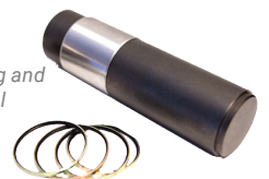
Bronze Bushing and Seal Driver Tool