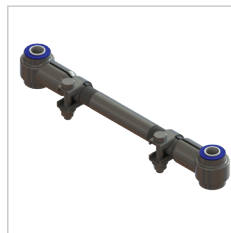
TR53-45305 Torque Rod Adjustable 19 1/4"