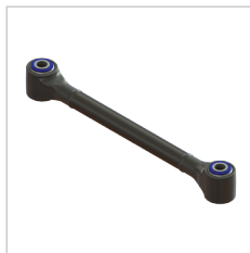
TR83-41201 Torque Rod Small Eye 19 3/8"