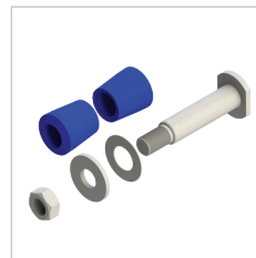
TH47-39700 Torque Rod Bushing Kit