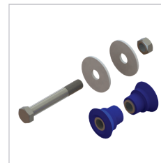
TH83-37640 Torque Rod Bushing Kit