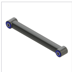
TR83-41520 Torque Rod Fixed Length 19 7/8"

Here are some examples of our trailer torque rods and bushing kits. Find more on our website.