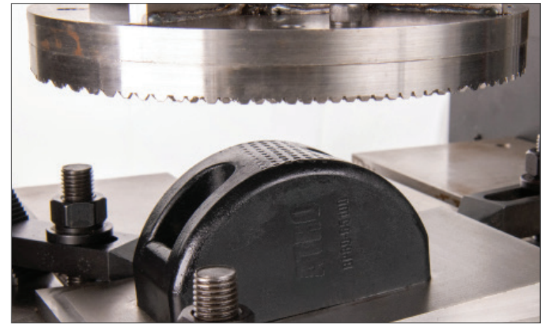
The ATRO polyurethane bumper lasted through 250,000 cycles and was still going strong. The bumper contact surface is still in good shape.