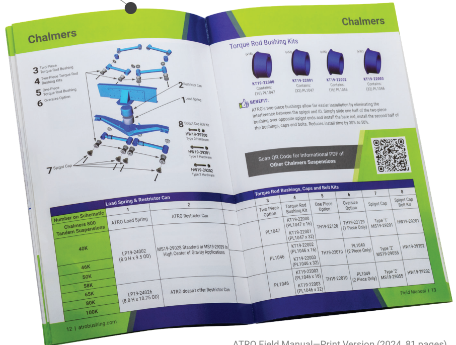
ATRO Field Manual—Print Version (2024, 81 pages) Pocket Size 5-1/2" x 8-1/2"