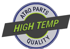
KT59-62004-HT (xxx) Engine Mount Kit w/Hardware, Rear (High Temp)