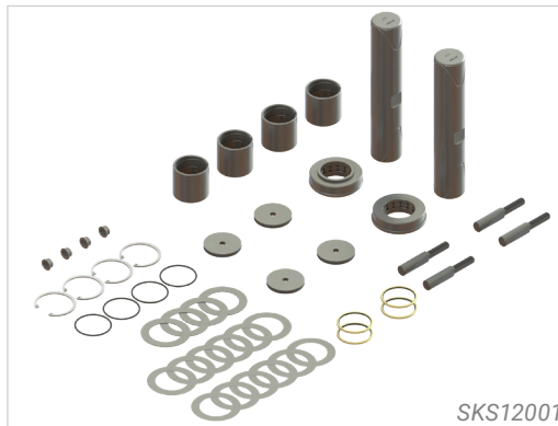
Detailed CAD product images showing kit components.